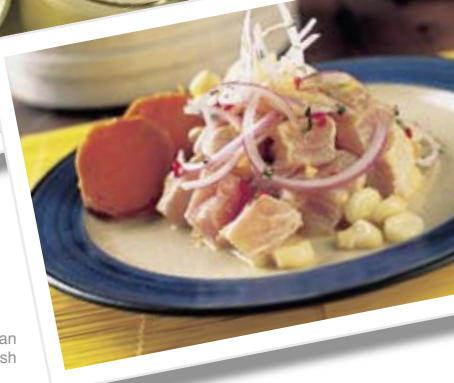
Cebiche, Peruvian cuisine's emblematic dish