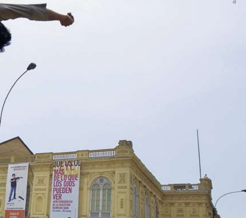
CULTURE IN MOTION. Lima Museum of Art

groups combining different expressions of scenic arts in just one show.