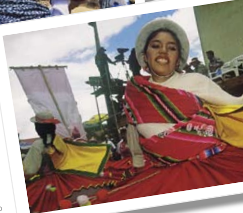
Candlemas festival, Puno

ANDEAN PIETY. The procession honoring Corpus Christi in Cusco