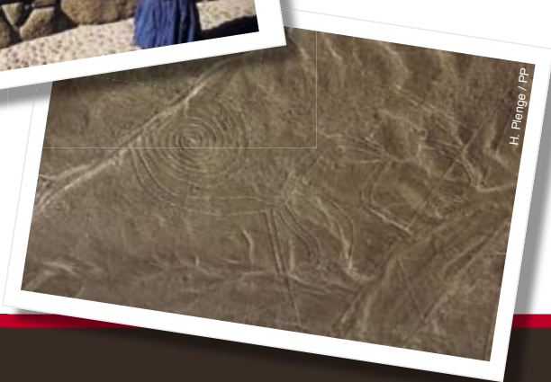
The Nasca Lines. Monkey geoglyph