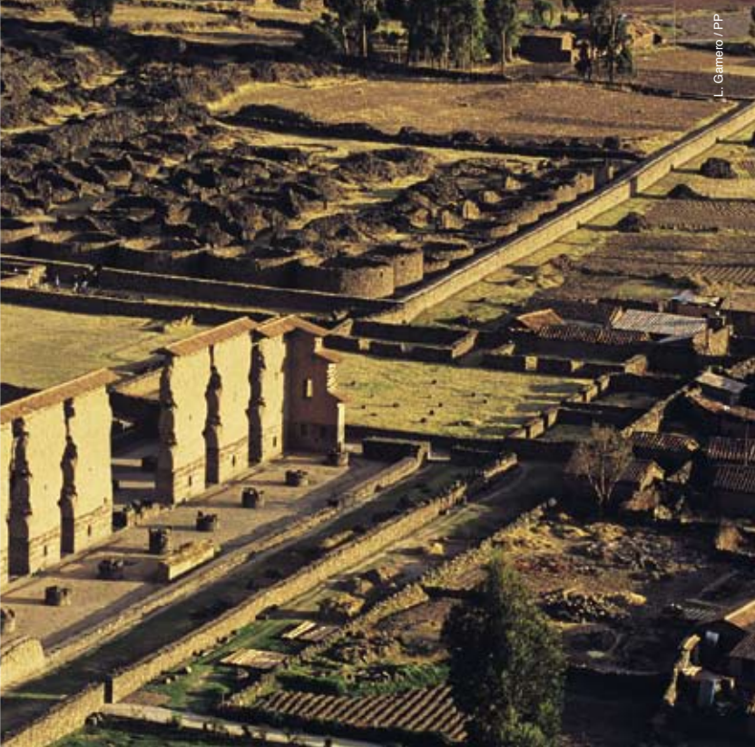
MONUMENTAL LEGACY. Wiracocha temple in Raqchi, Cusco

a culture that lives and breathes, reinventing itself every day. Peru is also an encounter between the ancient and the modern, a place where past and present live side by side. It may sound complicated to you, but be happy because it is not – the complexity of Peruvian culture is founded on its charm and originality that it easy to understand. Come and see by yourself.