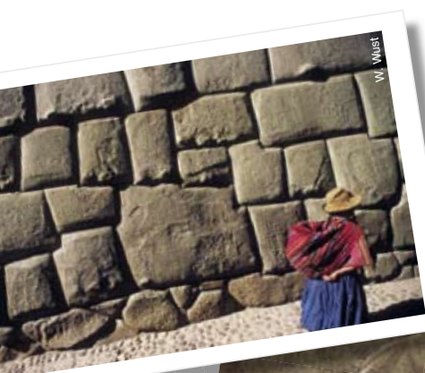
Hatun Rumiyoq Street and the Twelve Angle Stone in Cusco