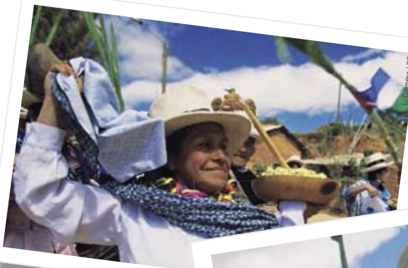
Celebration of the Raymillacta Festival in Chachapoyas

The spirituality of Peruvians flowed from the syncretism of ancient Andean religions and the Catholic faith brought by the Spanish. Even today, pre-Hispanic gods continue being worshipped in different images of Christ, the Virgin Mary and Catholic saints. Most of the 3,000 festivals celebrated throughout the year in Peru are religious in nature, and each village finds joy and reasons to be thankful or to ask for the blessing of its patron saint. Festivals are also a good time to welcome back those who left their native towns or to receive new pilgrims, a reason for even more joy. Amen.