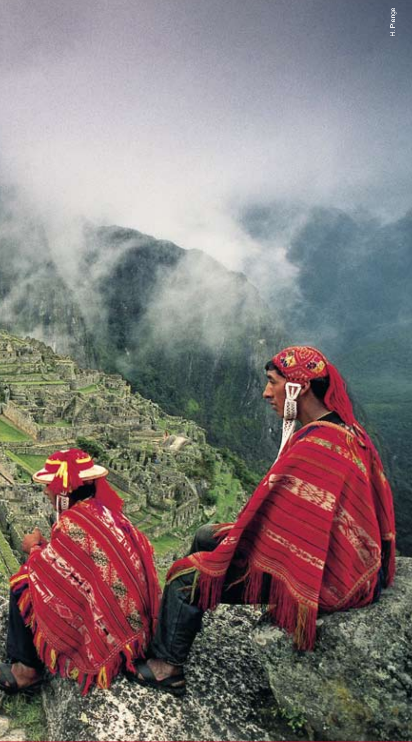
WONDER OF THE WORLD. Incan citadel of Machu Picchu, Cusco