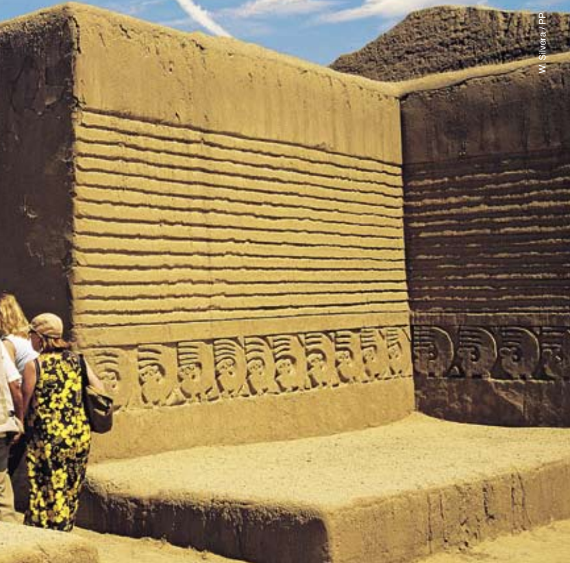
WORLD HERITAGE. Citadel of Chan Chan, La Libertad