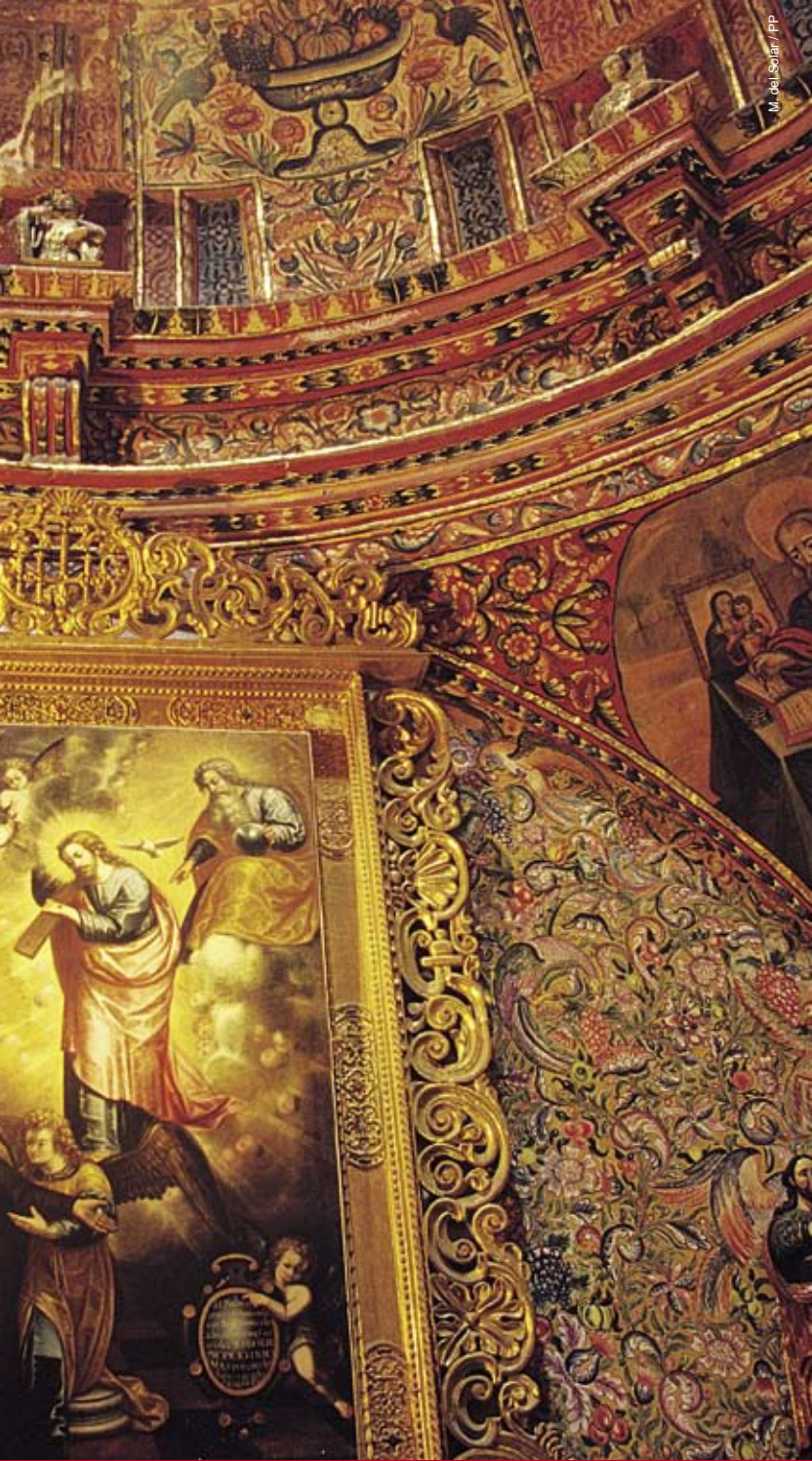
SPANISH COLONIAL ART. Interior of the dome of the Company of Jesus Church, Arequipa